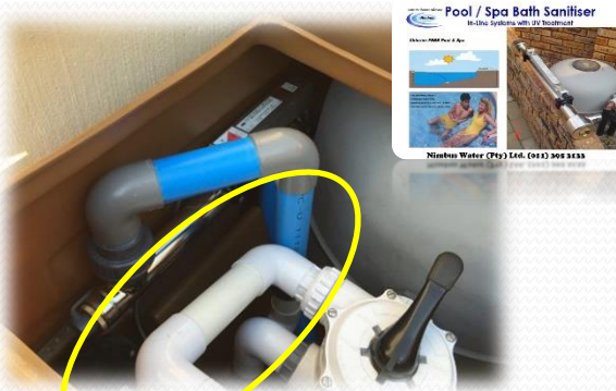
R8000-P complete @ R6995.00 + VAT ex factory, plus installation by quote

ABOVE - Typical example of a R8000-P stainless steel ultra violet system installed, as a Pool or Spa Bath Sanitiser to disinfect the water. Reduces chlorine consumption by +- 90%. OR, USE YOUR POOL WATER in the home, as a water back-up system!